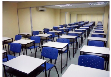
Bench Fitting Area