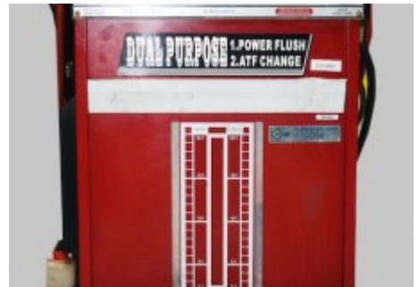
Power Steering Fluid Exchanger Machine